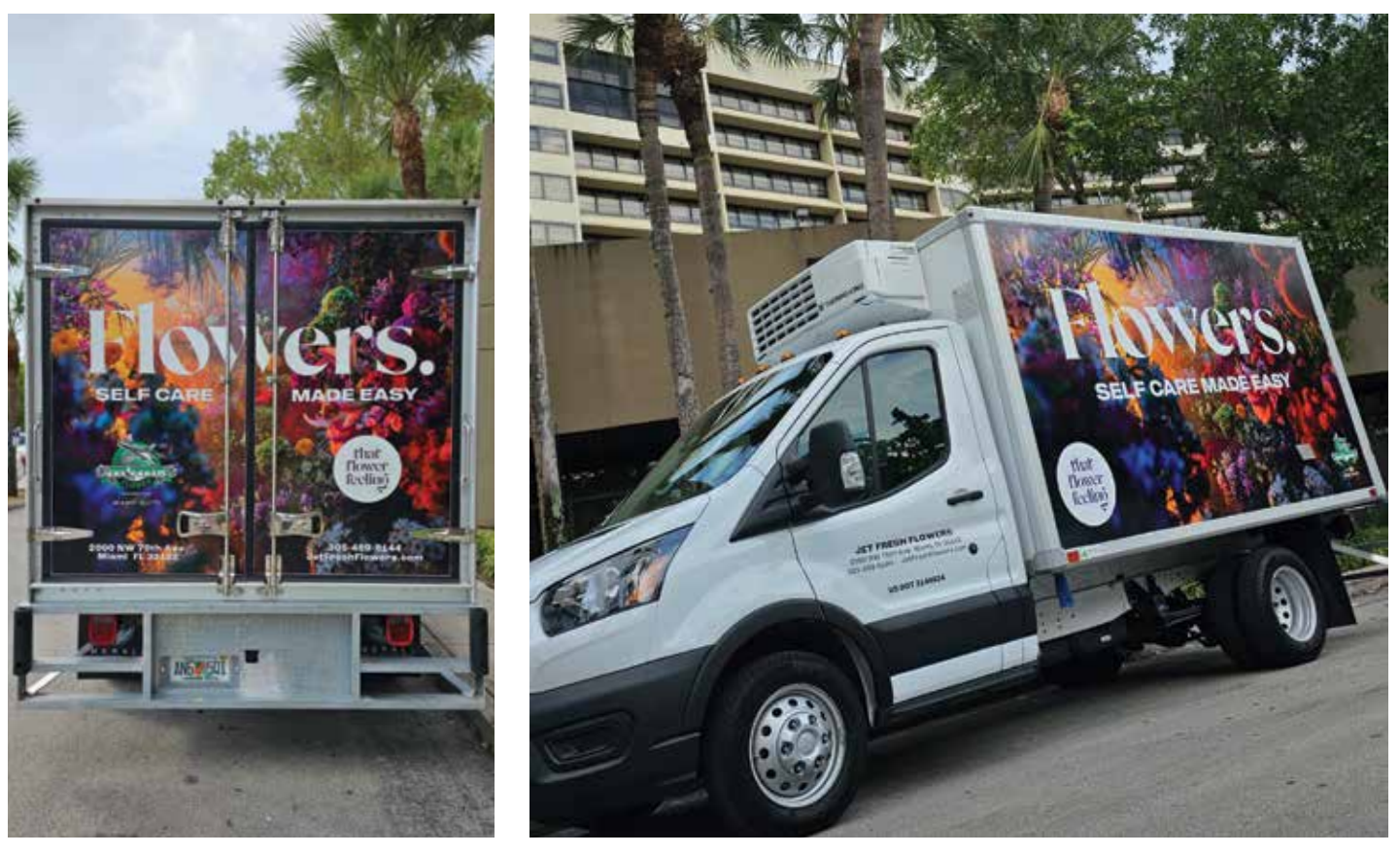
MASS MARKETING Jet Fresh Flower Distributors in Miami used the campaign's assets on one of their delivery trucks, enabling the campaign to reach thousands of consumers as it drives through the city.

Foundation can expand the campaign and refresh the assets," Bongaerts says.