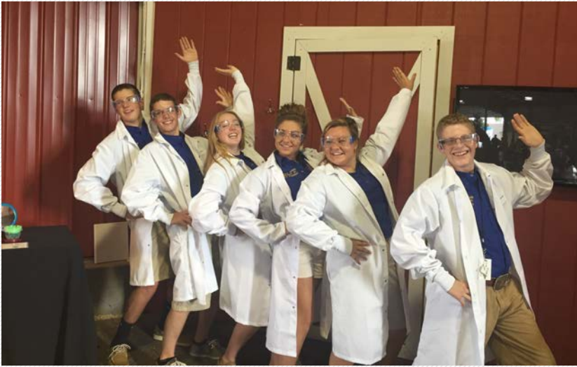
Indiana FFA members volunteer with employees at the State Fair booth.

Corteva Grows Science Outreach is a global science outreach program that empowers employees to inspire their communities by promoting scientific literacy.