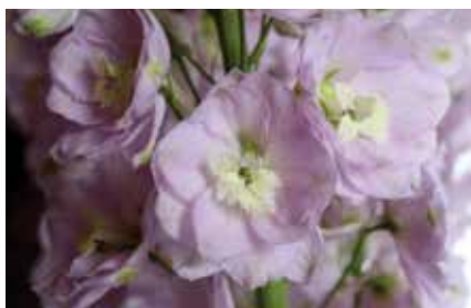
'PINK RIVER' DELPHINIUM Valleflor