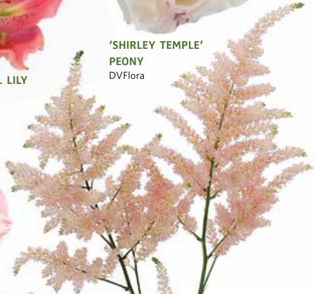
'PINK EUROPA' ASTILBE DVFlora