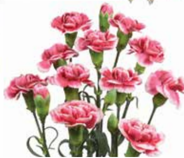
'AMBITION' SPRAY CARNATION Dümmen Orange