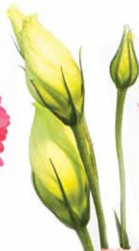
'BENSON' ORIENTAL LILY Sun Valley Farms