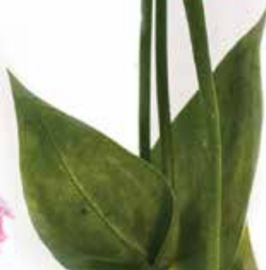
'MARIACHI PINK' LISIANTHUS Esprit Miami