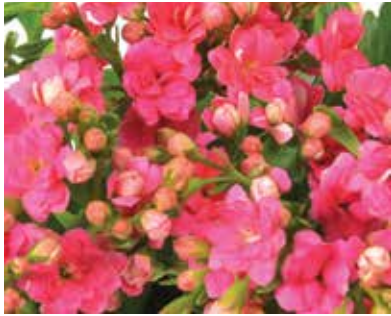
PINK KALANCHOE Sun Valley Farms