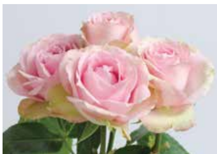
'PINK IRISCHKA' SPRAY ROSES Royal Flowers