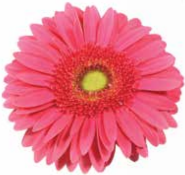
'AVIANCE' GERBERA Green Valley Floral