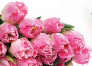
'AUXIERE' FANCY TULIP Sun Valley Farms