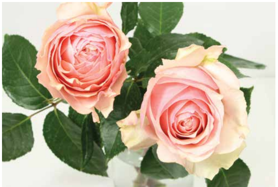
'PARLE MOI' GARDEN ROSE Green Valley Floral