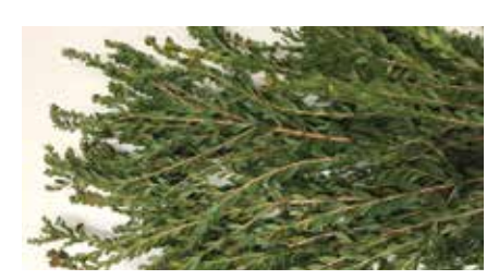
'TEARDROP' MELALEUCA Ocean View Flowers