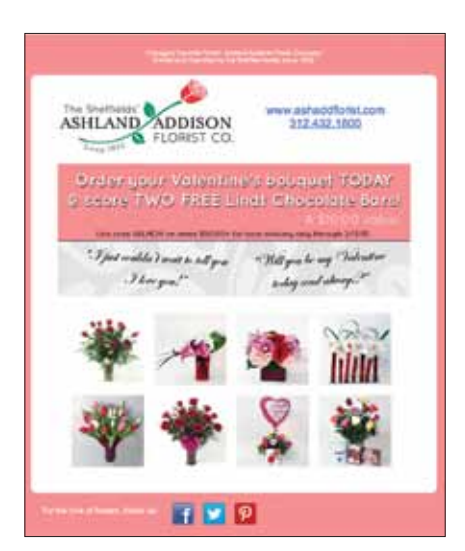
DAILY DEAL Ashland Addison Florist in Chicago keeps holiday reminders subtle (and not tiresome) with email messages that change every day.

a consulting firm, email is 40 times more successful at acquiring new clients than either Facebook or Twitter. Similarly, Campaign Monitor, an online marketing application, found customers are six times more likely to click on a link in an email than one in a tweet.