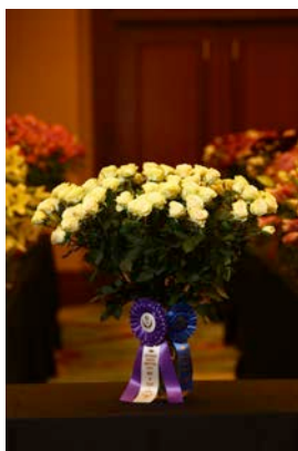
Best in Show Spray Rose Variety Name: Brilliant Stars Green Pink Exhibiting Company: Connectaflor