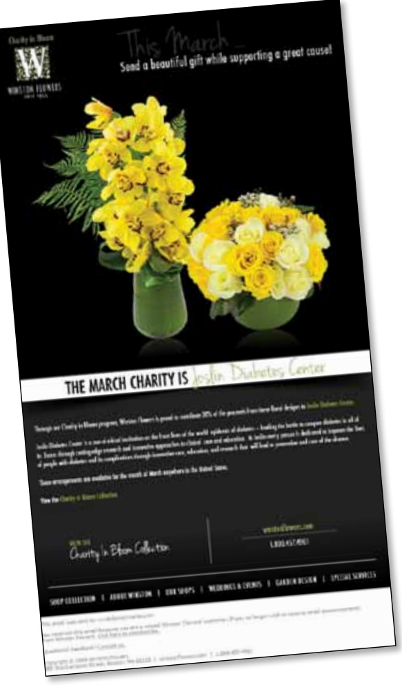
ADVANCED NOTICE At the start of each new Charity in Bloom partnership, Winston Flowers sends an email to customers detailing the featured charity, and why the florist supports the cause.

of consumers want to know what companies are doing to make the e.