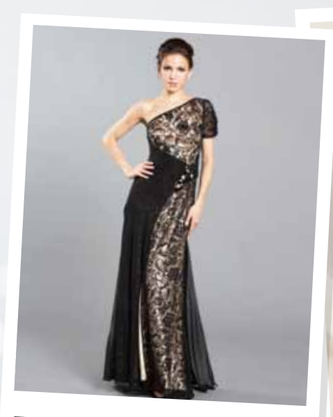
Embellishments. In a trend that seems made for florists to capitalize on, hipster sweetheart Zooey Deschanel and Michelle Dockery ("Downton Abbey") shimmered in ensembles with plenty of texture and decorative trimming — spangles, sequins and beads; the gurus at Harper's said that the paillettes and appliques provided "the power of something extra" to the night's dresses.