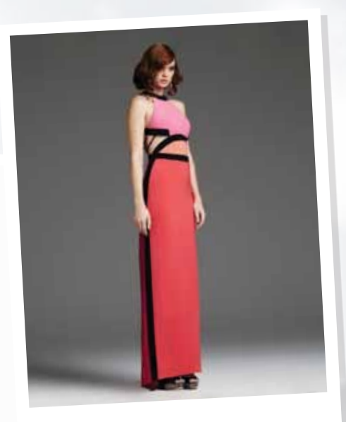
Color blocking also was a fashion movement of note at the Golden Globes, with stars such as Sandra Bullock ("Gravity"), in pink, black and blue, and Julie Bowen ("Modern Family"), in red and purple, making use of creative color combinations to stay on trend.