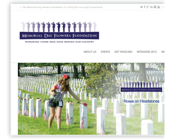
HONORING VETS Thanks to support from the floral industry, the Memorial Day Flowers Foundation honored service members at more than 200 cemeteries and ceremonies across the country.

38 FLORAL MANAGEMENT | JULY 2015 | WWW.SAFNOW.ORG