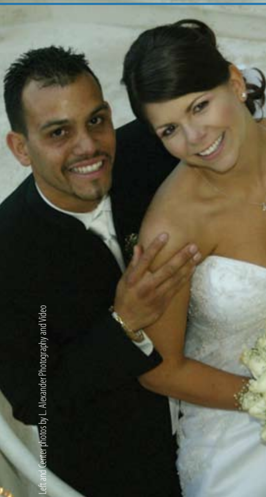
Left